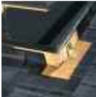
Installing roofing underlayment between the skylight frame and roofing material will help prevent condensation on the cladding and flashing.

Condensation can form on more than just glass. In some cases, the installer neglects to use roofing felt and insulation between the frame of the unit and the rough opening. This allows warm, moist air to escape from the room and come into contact with the underside of the flashing and/or cladding. The resulting condensation will drip back into the room between the frame and rough opening, giving the appearance of a leak. Having the roofer or installer add felt and insulation between the frame and rough opening should prevent this problem.